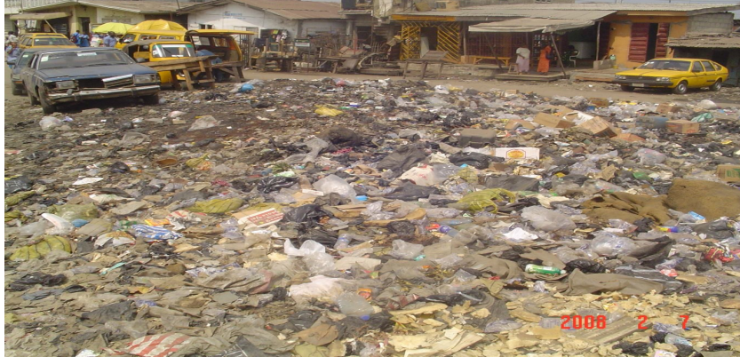
Plate I: Poor environmental condition in Makoko