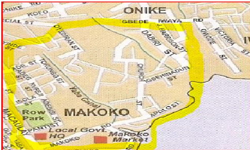
Fig.1: Map of Yaba Local Government area council showing Makoko community

for two reasons mainly. The first reason has to do with location- the neighbourhoods or areas where poor people can afford to live are often undesirable places of real estate because they are located near industrial area, some near water front as in the case of Makoko settlement. They are exposed to high levels of air and water pollution, and are more subject to damages by natural hazard. Second, poor communities often lack political power to pressure government for a cleaner environment or to obtain environmental services such as a clean and reliable water supply, sanitation, waste collection, and drainage.