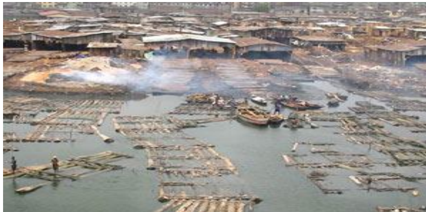
Plate II: An Aerial view of the market extension on water in Makoko