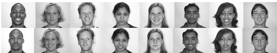
Fig. 1 Photographs used in the current study. Participants assessed either the faces in the upper or those in the lower row

All participants were asked to provide basic demographic information on their gender, age, student status, religion, and father's highest degree. Individuals were also asked about their ethnicity and nationality in cultures where the team leaders decided that asking about this information was not controversial. The main part of the questionnaire had participants rate eight faces, four smiling and four non-smiling, that were balanced for gender and represented different ethnicities (four European American, two African American, and two Indian, see Fig. 1; the need for ethnic diversity is stressed by Matsumoto and Kudoh 1993) on a 7-point Likert-type scale (1 = trait doesn't fit at all to 7 = trait fits perfectly ) measuring intelligence (i.e., intelligent , dumb , smart , and stupid ) and honesty (i.e., honest , false , authentic , and unnatural ). Questionnaires in cultures that joined the project later also included five items from Rosenberg's self-esteem scale (1965), three items from Dunton and Fazio's motivation to control prejudiced reactions scale (1997), and three additional