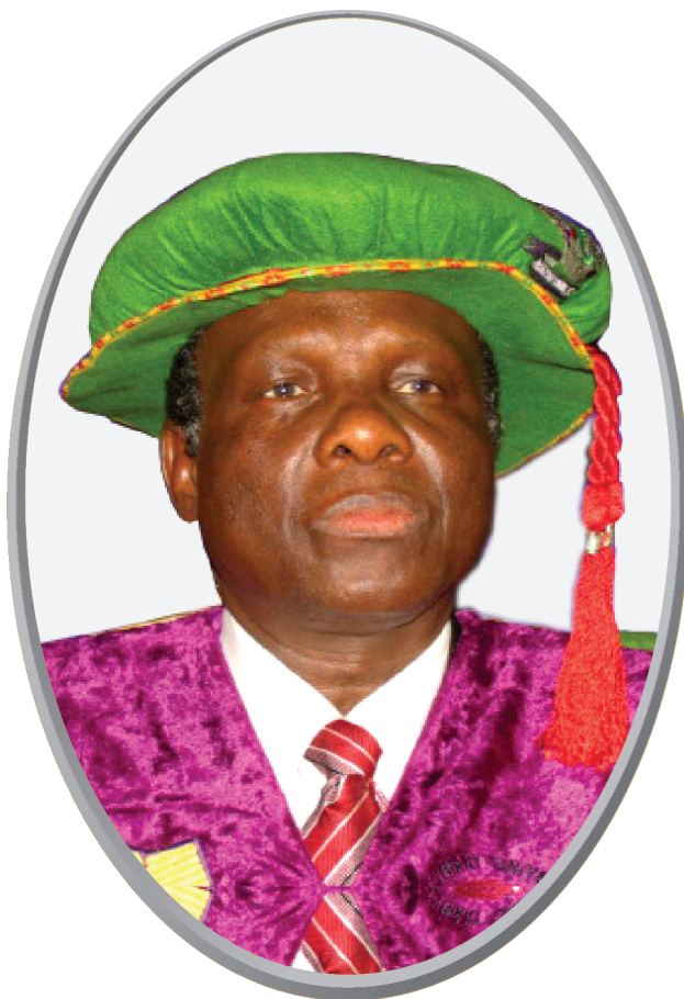
Professor Jerry Gana , CON, Ph.D, DD, FRGS, FNASS, FNIPR Former Nigerian Minister of Information & Orientation, Pro-Chancellor/Chairman of Governing Council, University of Lagos.