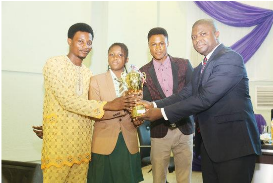
Winners of the quiz competition, Scholars Universal Academy, with competition officials