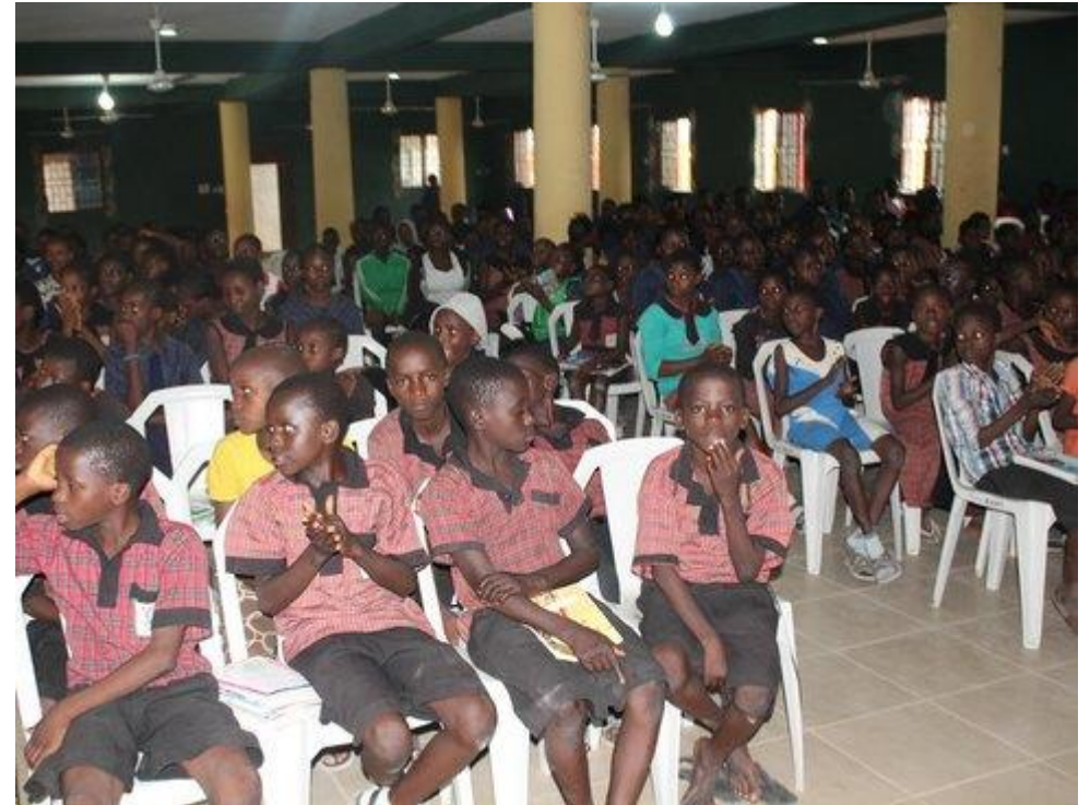
Most children in this home were Boko Haram victims who have either lost one parent or both