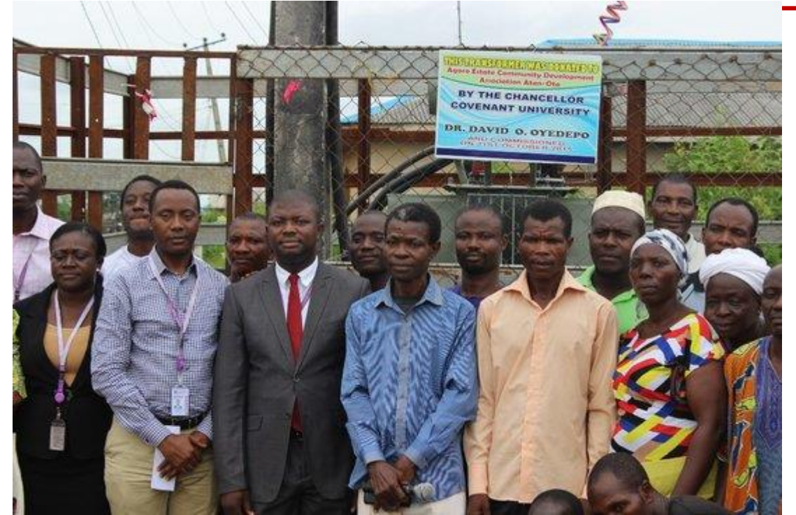
500 KVA Transformer donated to Onigbongbo Community