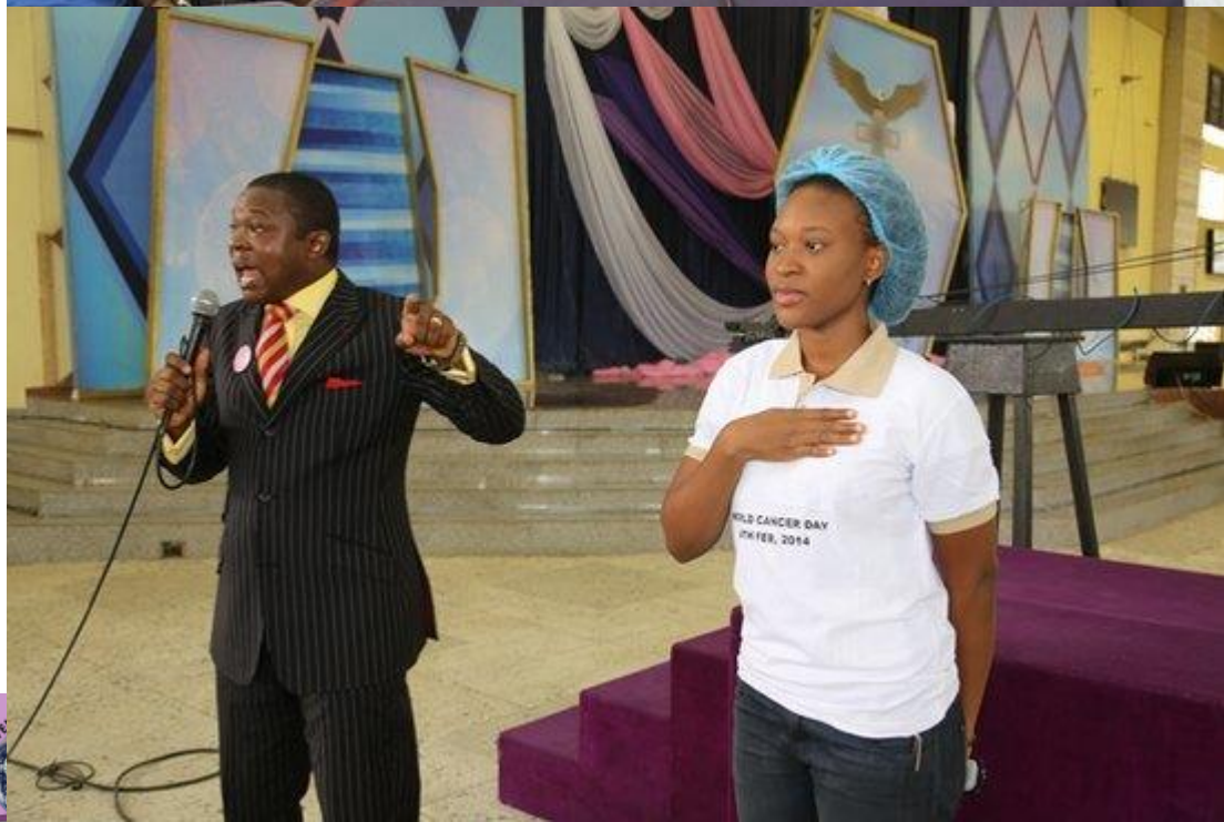
CDIIC marks World Women's Day with Breast/Cervical Cancer Awareness Seminar and Testing in 2013