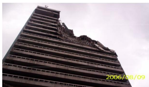
Figure 3: The Nigerian Industrial Development Bank (NIDB) building upon collapse. Source: [11]

The abrupt, shocking collapse of tall buildings has produced countless tragedies throughout history, emphasizing the need for sound, safe and ethical engineering design. Structures that were outwardly rock-solid all over the world have cracked, split, and disintegrated underneath people’s feet. In some instances, the collapse of towering edifices took less than ten seconds; bringing them down to the barest, turning them into debris and thereby burying people. Despite the fact that many structures are aesthetically pleasing; a lack of attention to proper safety standards, human error, and unenforced building codes potentially lead to truly terrifying catastrophes. Many tall buildings have collapsed over the years. Some of the most devastating collapses include the twin towers of New York, USA that went down as a result of the terrorist attack of September 11, 2001 killing close to 3000 persons, Sampoong Departmental Store, South Korea that crumbled under 20seconds in 1995 killing about 500 people, the Lotus Riverside Building in China that toppled over, completely intact without crumbling in 2009 and the New World Hotel, Singapore which in 1986 collapsed in less than 60 seconds, killing about 50 people. The causes of collapse of the last 3 cases of tall building collapse can be traced to poor engineering judgments and incompetence of the workers involved in the construction process.