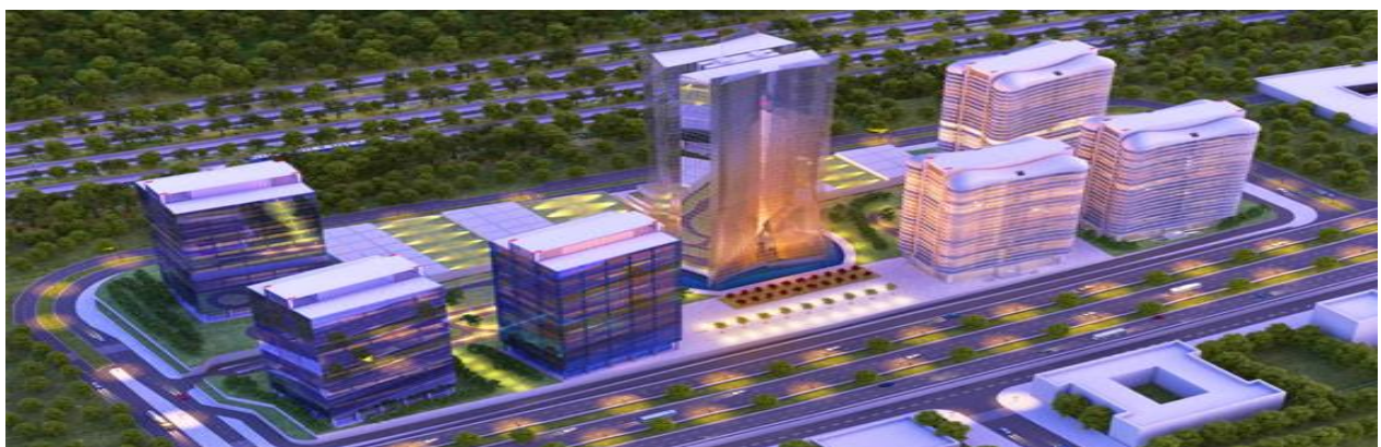
Figure 2: The proposed World Trade Centre in Abuja; Source: www.churchgate.com (2013).