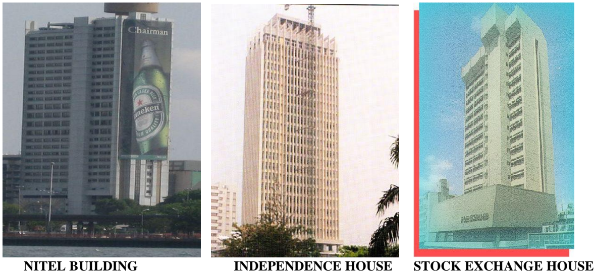
Figure1: Major high rise building in Lagos, Nigeria.

The Abuja skyline is made up of mostly mid-range buildings, with just few tall buildings. Only recently have tall buildings begun to appear. Most of the buildings are modern, thereby reflecting that it is a new city. The Millennium Tower, the Nigerian Cultural Centre, and the municipal building (all part of the proposed Nigerian National Complex, shown in Fig. 2) are part of the many projects in the Central District of Nigeria’s capital city of Abuja. At 170 meters, the Millennium tower would be the tallest building in Nigeria, going beyond the 160m high NITEL building.