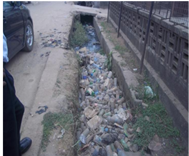
Figure 3: blocked drains as a result of abuse of drains with waste deposits

After each occurrence of flooding and storm, wastes are dumped in ditches and drainage channels. These drainage channels remains unattended to and thereby get clogged. This causes blockage of channels for the subsequent runoffs and other contents. Figure 3 shows the deterioration of the functionality of the drains in these areas of study.