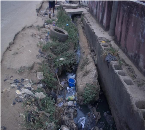
Figure 4: Showing a poorly maintained drain