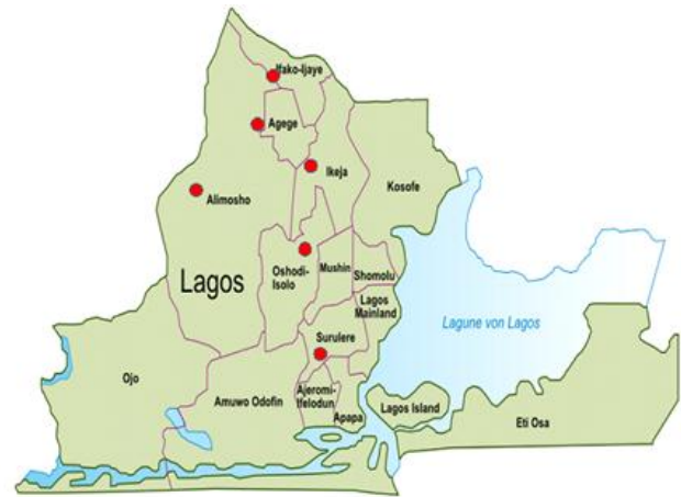
Figure 1. Lagos State Map showing the selected locations under study

The questionnaires designed respects the rights and anonymity of the respondents thereby ensuring confidentiality of the respondents. A total of 300 copies of a well compiled questionnaire addressing the most likely causes, effect of water drainage challenges as well as environmental challenges relating to the improper utilization of the drainage systems in the chosen locations were used.