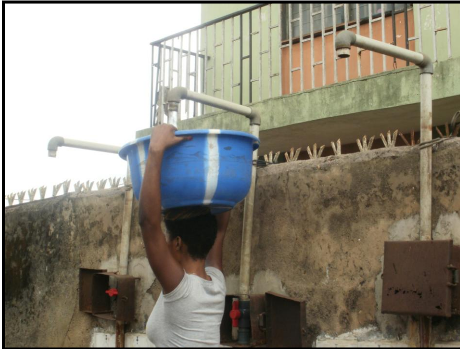
Figure 2. Individual Fetching water with an open container at a commercial borehole stand-post

bathing, cleaning, washing and other general use but without drinking. Most residents buy the popularly called “pure water sachet” for their consumption while some are indifferent, with the mindset that the water they drink would not kill them. Most house types are the long informal type of building popularly called “face to face” with an average of 10 rooms and five (5) household members in each.