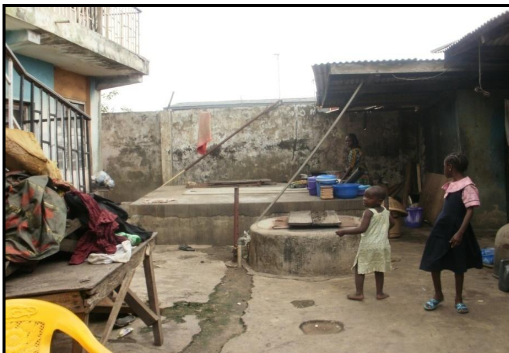
Figure 3. A household having water source close to the septic tank