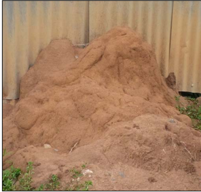
Figure-1. One of the termitaria prior to sampling.

some chemical properties such as: the metallic content, pH, organic carbon (OC), organic matter (OM) etc.