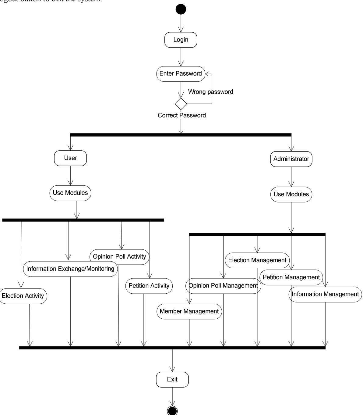
Figure 1: Activity diagram for e-democracy system

objects (Mincer-Daszkiewicz, 2003). It offers diagrams that provide different perspective views of the system parts. Figure 1 shows the activity diagram of the E-democracy system. A user log into the system with a unique user name and password to access all the modules that make up the system. When done, he or she click on the logout button to exit the system.