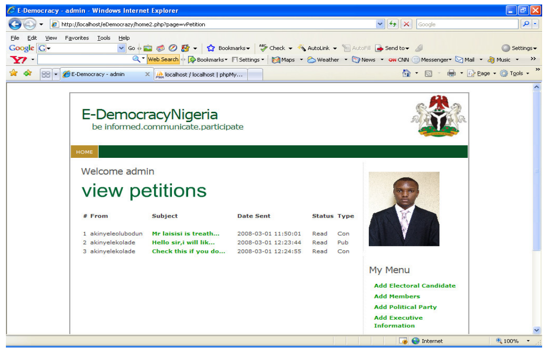
Figure 3: View Petitions Page for Administrator