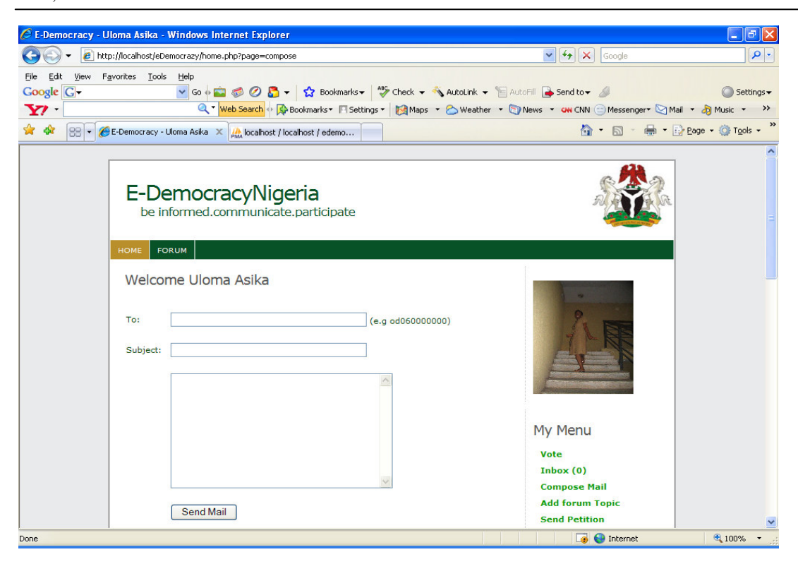
Figure 4: Send E-mail Page for Citizens.