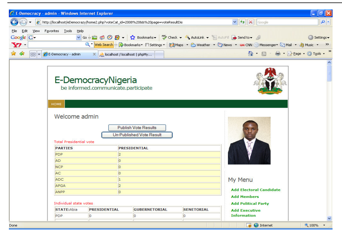
Figure 2: View Election Result Page