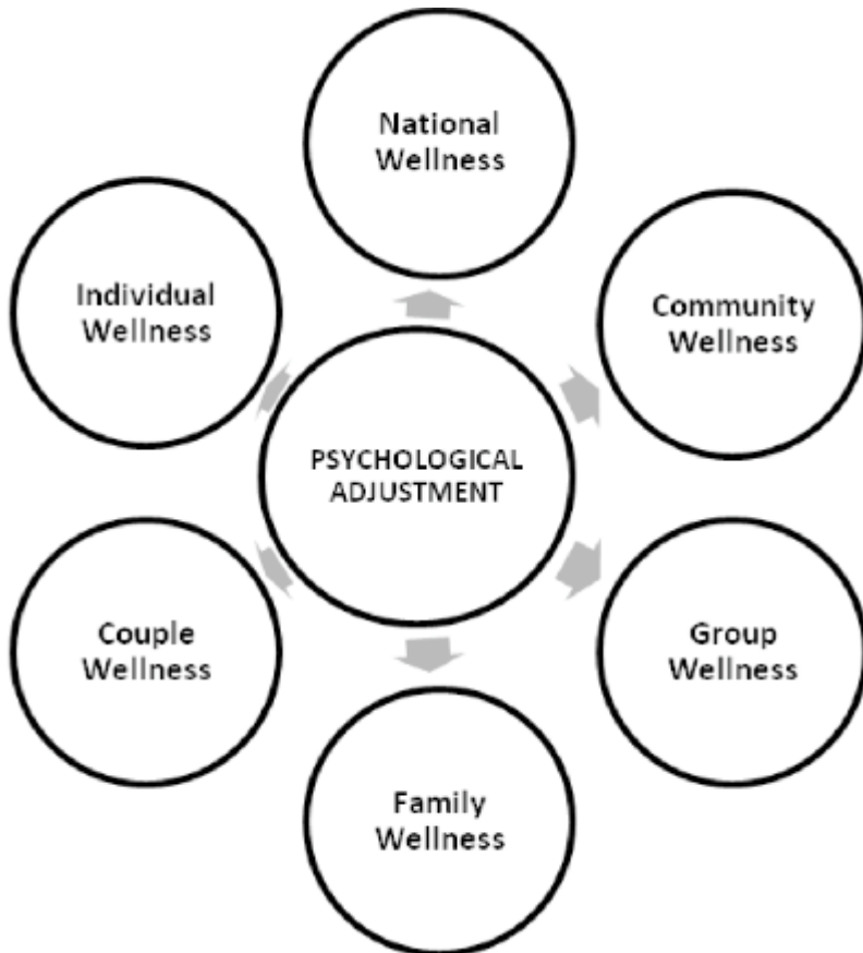
Fig. 1: Derivatives of Psychological Adjustment

Sweeney and Witmer (2000) summarized wellness as: “a way of life oriented toward optimal health and well-being, in which body, mind and spirit are integrated by the individual to live life more fully within the human and natural community.