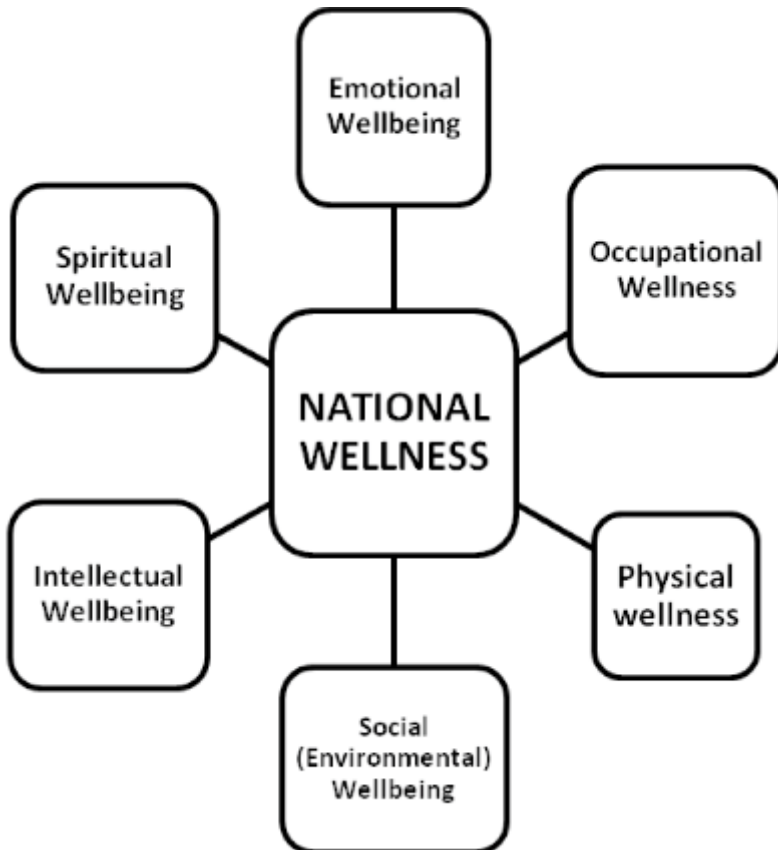
Fig 2: Achieving National Wellness