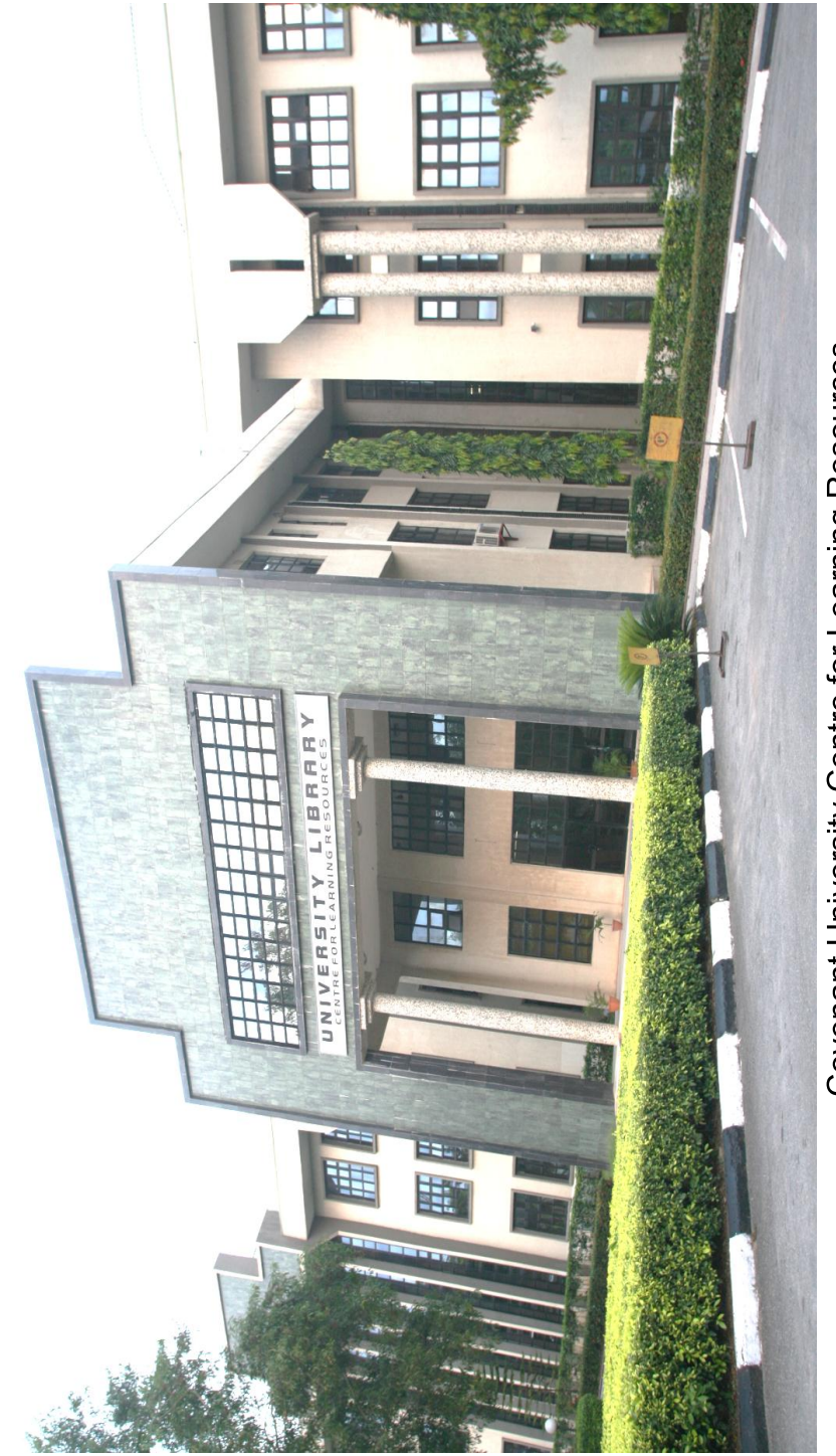
Covenant University Centre for Learning Resources